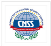
Committee on National Security Systems (CNSS)