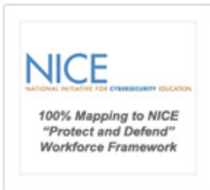
The National Initiative for Cybersecurity Education (NICE)